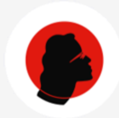
Carmen Team Sonic Network